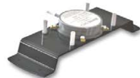
MD58 Compass Sensor Bracket Mount (available separately) SKU F058001*

*One sensor mount is a required option (available separately) - depending on the type of host magnetic compass; please contact Marine Data to obtain the correct mount.