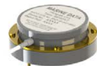
MD54 Compass Sensor Adhesive Mount (available separately) SKU F054001*